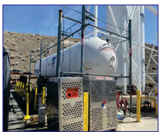
15,000 Gal. Liquid Propane Tank