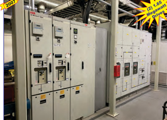
ABB Frequency Drive System with Related Switch Gea