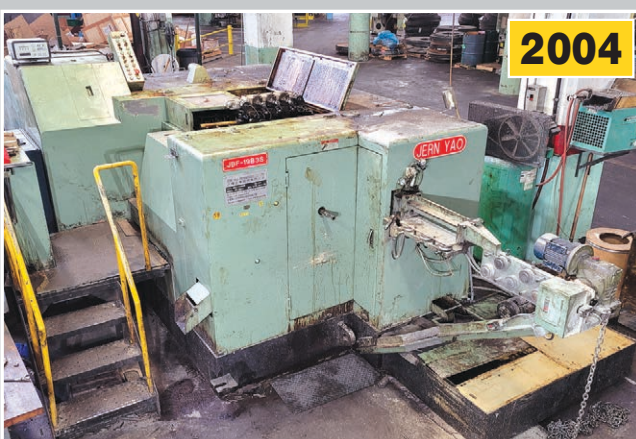
JERN YAO JBE-19B3S 3-Die 3-Blow Bolt Former