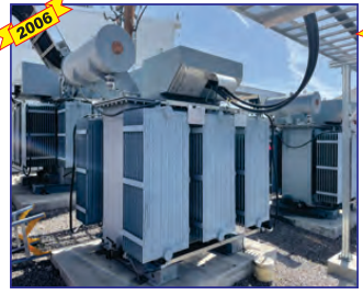
2100 kVA MF Pad Mounted Transformer